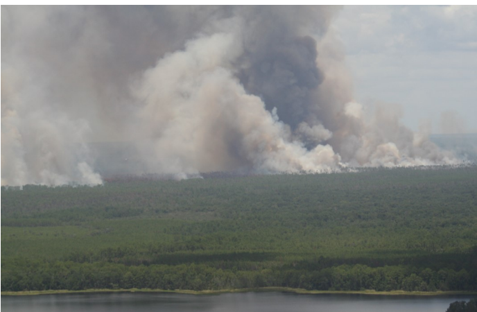
VSmoke can assist with your prescribed burn plan by providing important projections of downwind smoke concentrations.

VSMOKE is based on weather conditions and smoke-related problems found in the eastern United States, generally in flat or rolling topography. It was designed for single, low-to-moderate intensity surface fires and dry weather visibility impacts. Dry weather visibility generally means daytime use rather than at night when humidity levels rise.