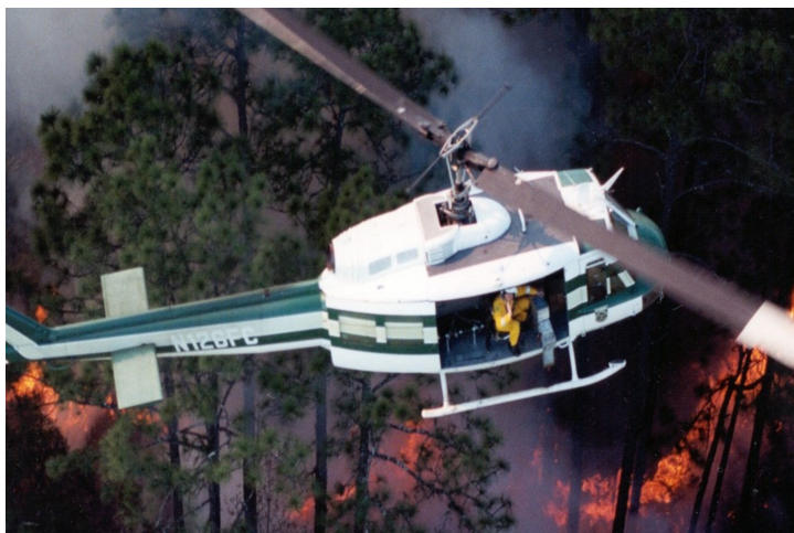
Aerial ignition systems can be used for large burn units or multiple small units, and generally allow for more rapid smoke dispersion than with ground-based devices.

there are many random bare spots in the unit. Newer machines minimize this problem.