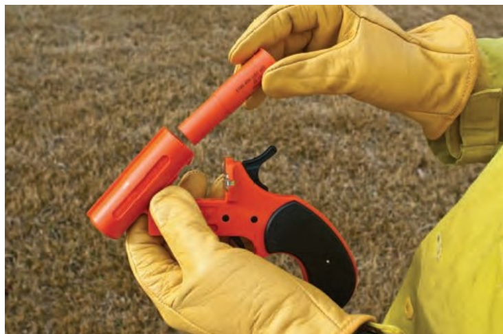
Fusees (shown in left photo) and flare launchers (shown in right photo) are lightweight and can be useful ignition devices when fuel or topography pose safety issues.