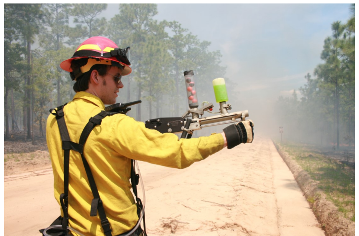
Hand-held DAID launchers allow prescribed burners to quickly ignite fire without entering potentially unsafe areas.

The ping-pong ball dispensing machine is easily mounted in both fixed- and rotary-wing aircraft. When using an older machine, I always recommended using a leather strap to secure it and having a sharp hunting knife within reach so in an emergency the strap can be quickly cut and the machine jettisoned. Although current models all come with a more reliable self-extinguishing capability, it never hurts to have a plan B. The balls are dropped at a set interval, and although adjustable by varying aircraft flight speed or the machine dispersal interval (older machines were prone to jamming during adjustments on the fly), it is a pain when