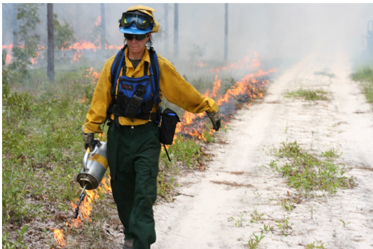
Figure 1: Hand-held drip torches are commonly used because they are economical, durable, and require little maintenance.

To use, one tips the drip torch so that gravity will move the fuel through the wand and out the mesh tip. When the tip is saturated, the torch is held upright and a match or lighter used to light the fuel-soaked mesh. Once lit, the torch is tipped downward so fuel flows out the end and is ignited as it passes through the mesh. The flow is controlled by a small breather screw on the outside top of the torch. When closed no air can enter the cylinder and fuel flow is stopped; when wide open fuel flows through the mesh spout in a steady stream. If a steady stream pours out, the breather screw is opened too wide and the torch will be quickly emptied, necessitating many trips back to the staging area for refilling. The desired flow rate is usually a slow steady drip which maximizes the length of line that can be