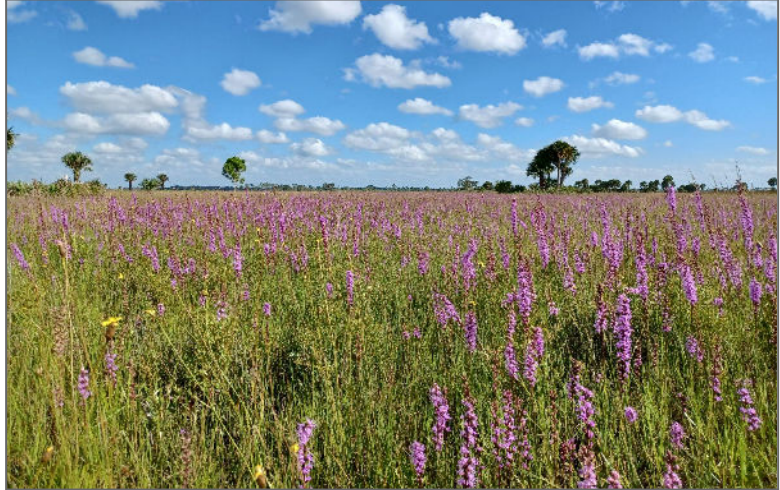
Wet Prairie Restored at DeLuca Ranch