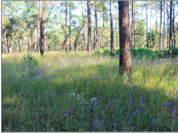
Pine Savanna Restored at Austin Cary Forest