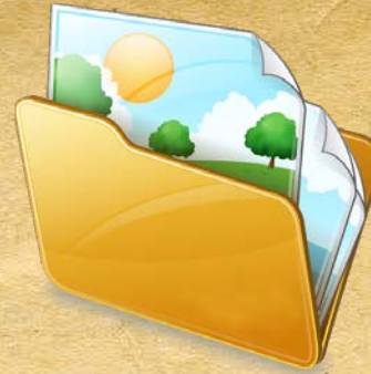
Community Wildfire Protection Plans