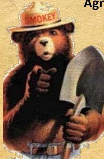
Prevention & Education