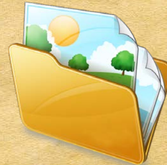
Community Wildfire Protection Plans