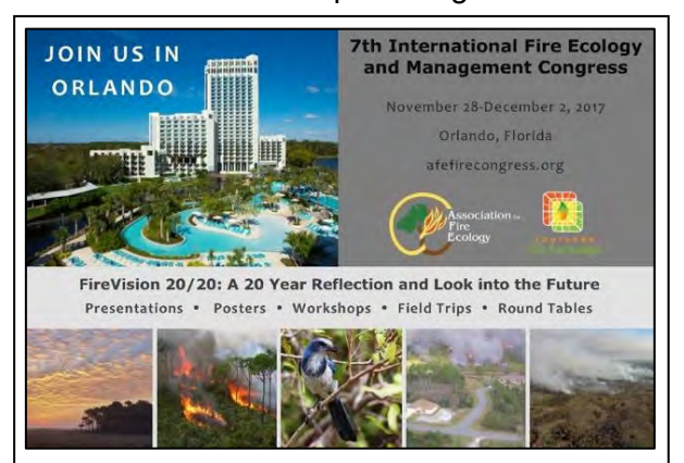
Figure 3. SFE co-led the 7<sup>th</sup> International Fire Ecology and Management Congress in late 2017 with the Association for Fire Ecology. The event had 517 attendees, 150 presentations and 7 field trips.

One of the plenary talks and several special sessions were specifically developed to solicit and share information about JFSP and FSEN impacts on fire science and regional fire management.