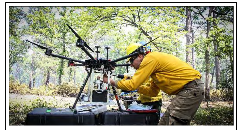
Figure 4. Researchers prepare to launch a UAV at the 2018 Prescribed Fire Science Consortium collaborative research event. SFE photos and videos have helped to communicate the relevance of the fire science research.

In the spring of FY18 for the second year in a row SFE supported the Prescribed Fire Science Consortium (PFSC) collaborative research burn event. We've taken the lead in creating a series of short videos with the PFSC scientists that document and communicate the relevance of their prescribed fire science research projects in the South (Figure 4). Our photos and videos of the FY17 and FY18 PFSC events have helped to solidify SFE as a key science delivery partner for the PFSC.