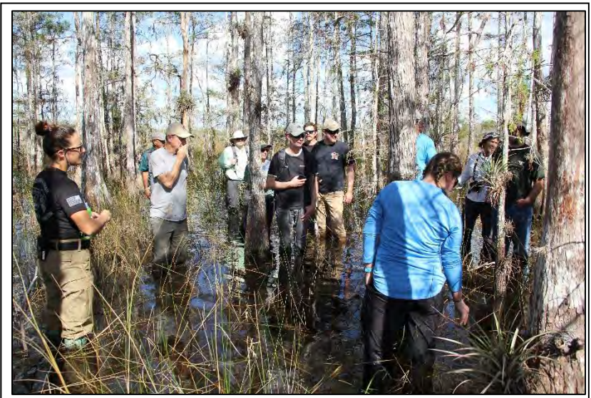
Figure 1. The December 2017 SFE overnight fire science and management tour of Big Cypress National Preserve in South Florida took an international group of participants from the Fire Ecology and Management Congress on swamp buggies deep into cypress domes, wet prairies and pine rocklands. Participants learned from regional scientists and managers about the science, successes and challenges of working with fire and hydrologic cycles in the 729,000-acre landscape.

The Southern Fire Exchange (SFE) began FY18 with a major role in the AFE Fire Congress in Orlando. That successful event was followed by a variety of webinars, workshops. presentations and publications. Along the way we expanded our partnerships and participation in landowner-focused training events, public outreach regarding prescribed burning and a new Tall Timbers (TTRS) initiative for prescribed fire science collaborative research. Our audience continued to expand with over 3000 now on our email list (see Table 1). Program participation (see Table 2) and post-event surveys, demonstrate that we are a successful and innovative fire science delivery program for the South. We are grateful to JFSP for their