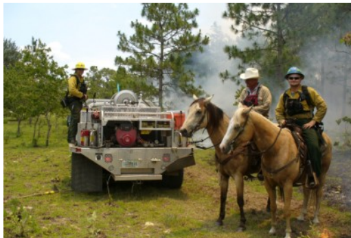
Ecosystem Restoration Team members working on a fire with the St. Johns River Water Management District in Florida.

An example of the on-the-ground collaborative work performed by the Conservancy are the Ecosystem Restoration Teams that are run by the Florida Chapter, funded primarily through grants. These Teams consist of NWCG-qualified fire staff and fire equipment that are utilized by many land management agencies in Florida in order to assist their on-site Burn Bosses and provide the “missing piece” in their fire operations—allowing multiple fires to take place throughout the state on optimal burn days. This allows for more frequent fire to take place within ecosystems that require short intervals between fire events in order to maintain their unique plant and animal diversity. Since 1999, these Teams have helped burn over 600,000 acres on over 200 individual sites in Florida.